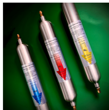
750cc Universal Purifier