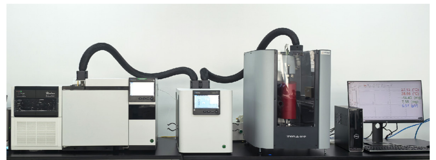
System for TGA-GC/MS based on the GC60 (with an infrared interface pre - reserved)